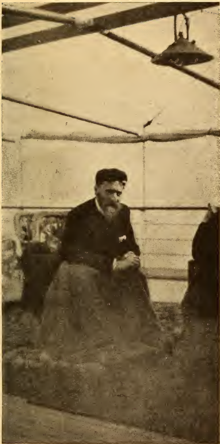
JOSEPH PULITZER LISTENING TO THE MORNING'S NEWS ON THE "LIBERTY"